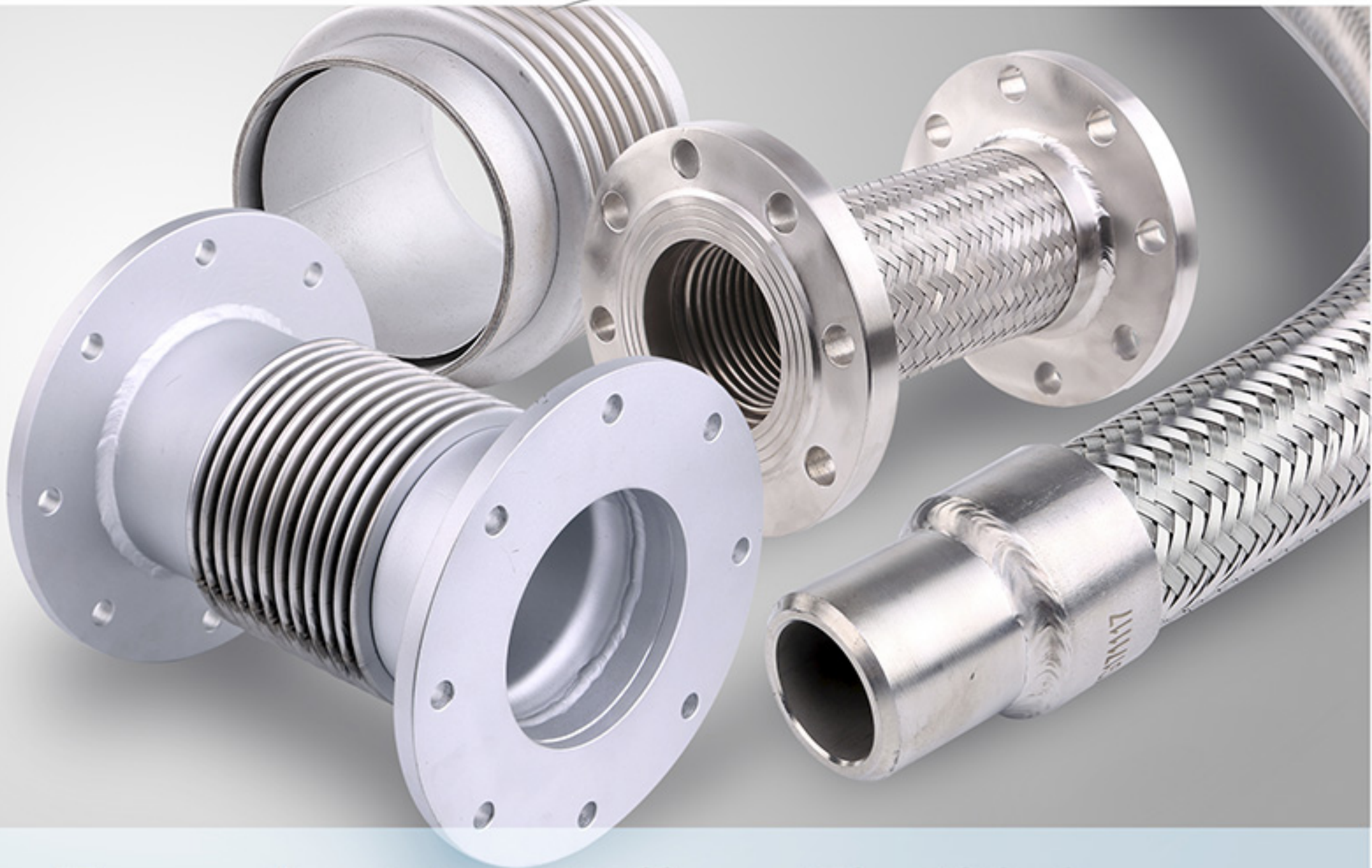
Expansion joint Bellow Flexible hose